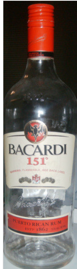
Teenage drinking is troublesome

Copyright © 2009 Clarity Digital Group LLC d/b/a Examiner.com. All Rights reserved.